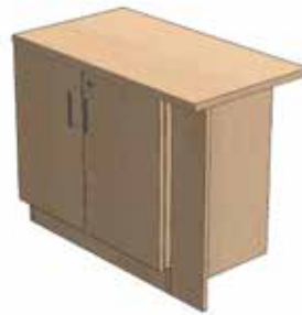
BASE STORAGE FRONT FILLER (Shown in application)