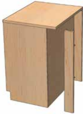
BASE STORAGE SIDE FILLER