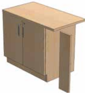
BASE STORAGE SIDE FILLER